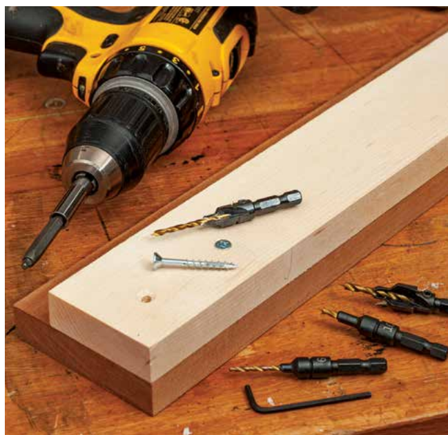
Milescraft CounterBit Countersink Drill Bit Set