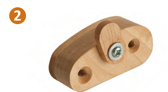
Dovetail Saws (1"-thick bandsawn shape to match handle openings; turn button)