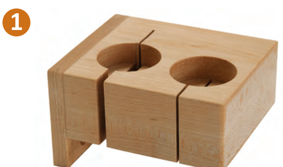
Japanese Saws (1½" block with thin kerfs; counterbored holes for handles)

Because no two tool collections are alike, the interior of your cabinet will likely look different from the one featured here. Still, a lot of the tools you'll hang will be similar. Cherry-pick from this gallery of ideas to help you get started. They employ dadoes, rabbets, grooves, and holes of various sizes in mostly 3/4"-thick stock. The 3/8"-thick rabbeted ends let you easily screw the holders to the cabinet back or door panels. Where necessary, turn buttons were added to prevent tools from falling down when opening and closing the doors.